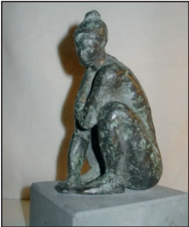
painting: Vietnamese lacquer on wood, 18 x 20 cm.; statue: bronze, height appr. 15 cm.